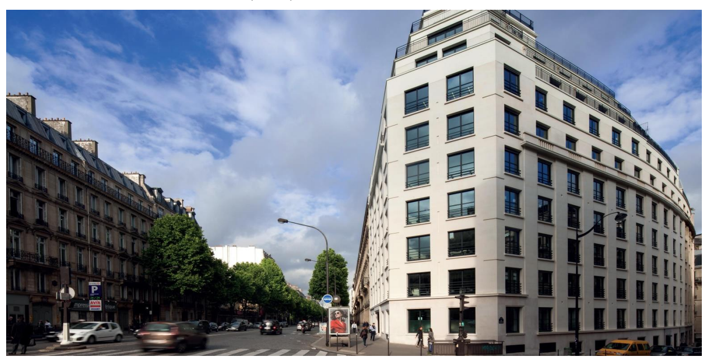
CCR Paris headquarters, 157 Boulevard Haussmann, 75008 Paris

The rehabilitation of brownfield sites in urban areas continues to be an important objective for the Group since its first investment initiated in 2012 and its participation in a second fund in 2017 in this area.