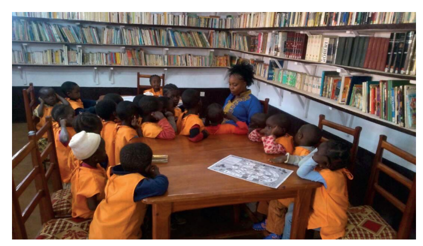
AHVEC - Students at the library

Since 1996, CCR has been committed to sponsoring humanitarian actions. Each year, the CCR Group provides its financial support to associations operating in the field, backed by the support of its employees. Thusly, CCR and its employees have delivered their support to almost forty associations for the past twenty years.